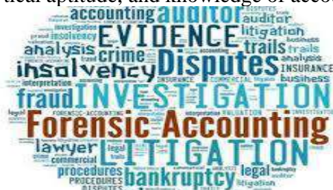
Figure 1: Forensic Accounting

A specialist area of study called forensic accounting is concerned with analyzing financial data and finding proof of wrongdoing, fraud, and financial irregularities. Since its inception in the early 1900s, it has expanded to include a broad range of initiatives aimed at financial crime in diverse contexts. Because of the multidisciplinary character of the field, which blends knowledge from many professions, forensic accountants are able to decipher complex financial transactions and spot concealed fraud tendencies. They have a special combination of investigative skills, analytical aptitude, and knowledge of accounting laws and regulations.