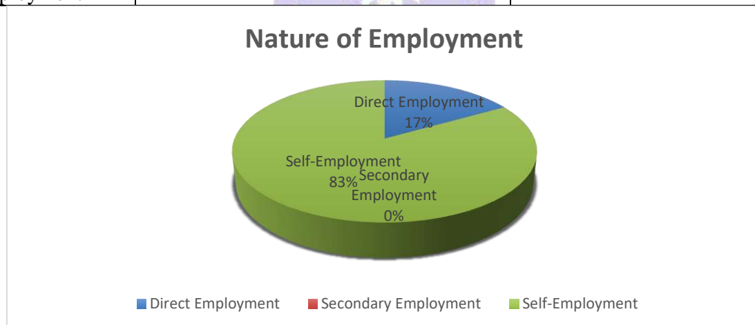
Figure 3: Creating a living through jobs in forests (N=100)

The information provided describes the type of work, the average number of mandays worked by a household annually, and the average annual income for direct, secondary, and self-employment categories. Households with direct employment work 14.52 mandays on average per year, bringing in an average salary of Rs. 3125.11. This illustrates how important it is for household livelihoods to be shaped by activities that are closely tied to the main source of income, like forestry or agriculture. On the other hand, secondary employment only contributes marginally to overall household wages, with a mean of 0.01 mandays per household annually, yielding a nominal income of 0.01. Among these, self-employment stands out as a significant contributor, accounting for 72.14 mandays on average per household per year and yielding an average income of Rs. 5241.11. This highlights the role that individual initiatives and entrepreneurial endeavours play in the economy and offers a more nuanced view of the various employment levels and sources that contribute to household incomes in the area under study.