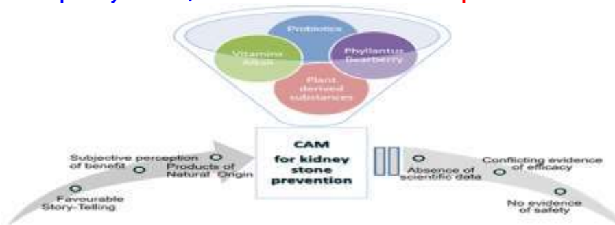
Fig. 5: Prevention of Kidney Stone