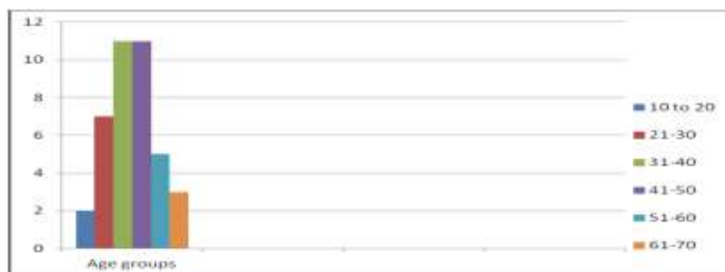
Fig. 2: Histogram showing frequency of kidney stone affected persons belonging to various age class intervals

examination are crucial, imaging modalities such as ultrasound, X-ray, CT scan, and MRI aid in confirming the presence, size, and location of kidney stones. Additionally, laboratory investigations, including urine analysis and stone analysis, are essential for identifying the composition of stones.