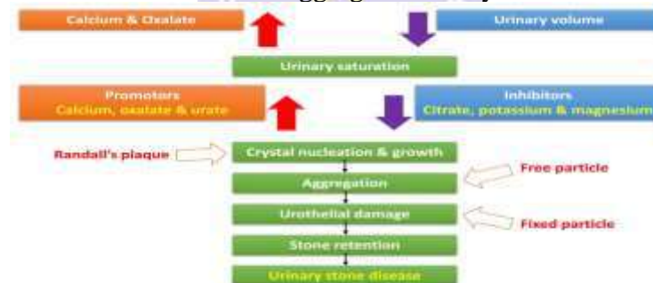
Fig. 1: Urinary Microbiome on Urolithiasis

The incidence of urolithiasis exhibits significant geographical and demographic variations. Certain regions with specific environmental and dietary factors report higher prevalence rates. Additionally, genetic predisposition and ethnic backgrounds may contribute to the differences in stone formation rates among populations. The economic burden of kidney stones is substantial, with significant healthcare costs associated with diagnosis, treatment, and potential complications. The pathophysiology of kidney stone formation is complex and involves a series of events that lead to the aggregation of crystals in the urinary tract.