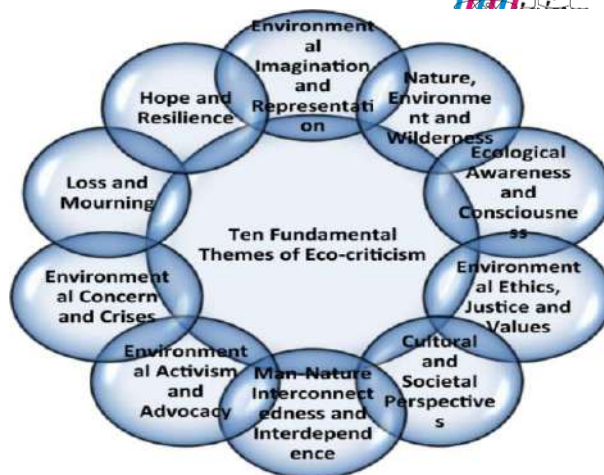
Figure 1: Fundamental Themes of Eco- Criticism

For example, the second-wave of ecocriticism has introduced the notion of postcolonial ecocriticism. Postcolonial ecocriticism speculates about the ways in which imperial histories exist within environmental changes. Postcolonial ecocriticism also reflectively critiques Eurocentric narratives of environmental custodianship as they reclaim marginalized ecological knowledge and indigenous ways of knowing that were often erased by the very things they were expanding at the time. In the space of postcolonial literature, we see a witness, or an accounting, of the environmental conditions that developed as a direct result of empire or colonization, for example, deforestation, monoculture, commodification of nature, etc. At the same time, we also see a witness to the disenfranchisement of different ways of relating to land. Amitav Ghosh's Ibis Trilogy is an example of postcolonial ecocriticism, that clearly illustrates a narrative tapestry that uses natural surroundings as a vehicle to understand political and economic trajectories powered by colonialism.